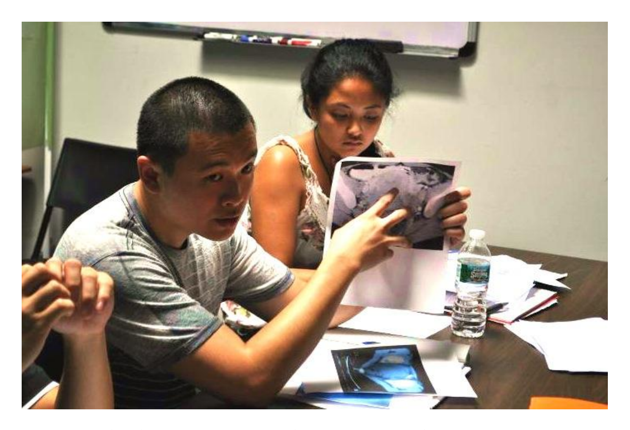
Presenting and analyzing patient MRI scans during group case study sessions.

The Emergency Cardiovascular Care Center at the Academy of Medical and Public Health Services (AMPHS) offers a very innovative, unique, and popular annual 6 week intensive program for prospective medical, nursing, public health, and allied-health school students designed to equip them with introductory clinical skills and offer experience of what the field of medicine and public health is all about.